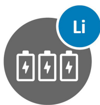
External lithium battery pack