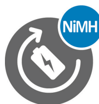
Rechargeable NiMH battery