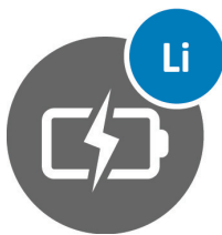
Internal lithium battery