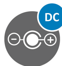
DC power with mains transformer