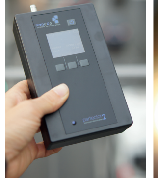
.6.18 21:17 $ א 22

More applications and full specifications on our website: www.naneos.ch