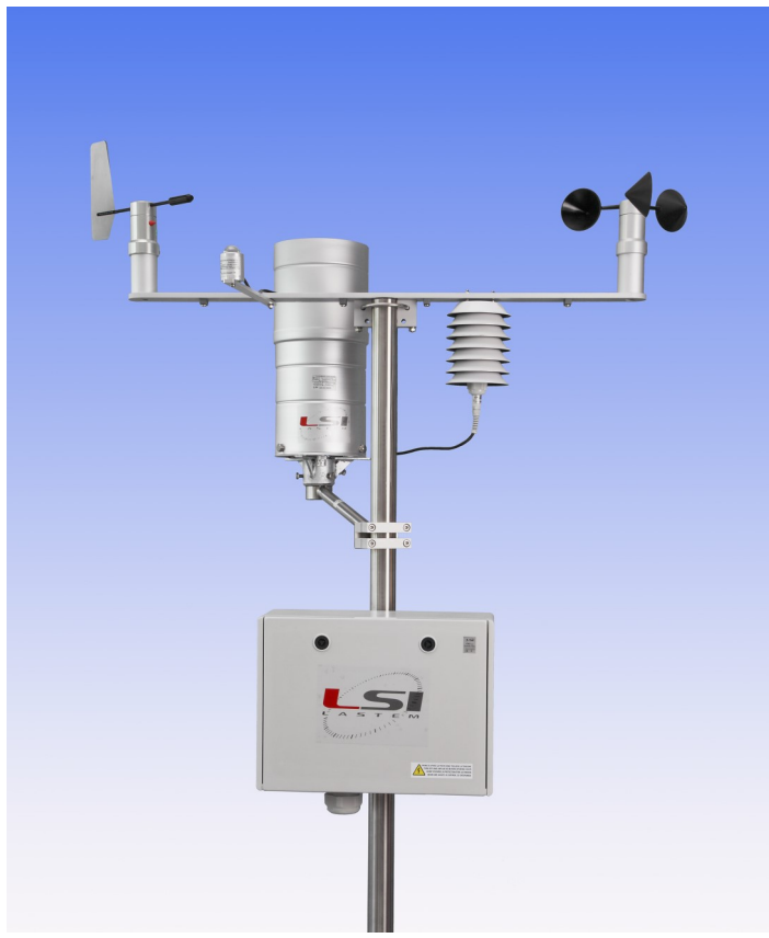
▶ As a stand alone solution the KME package is equipped with a IP66 enclosure and pole. LSI LASTEM's catalogue includes a vast range of IP66 enclosures, poles and towers.

Depending on the selected accessories, the KME package can become a stand-alone or a portable solution.