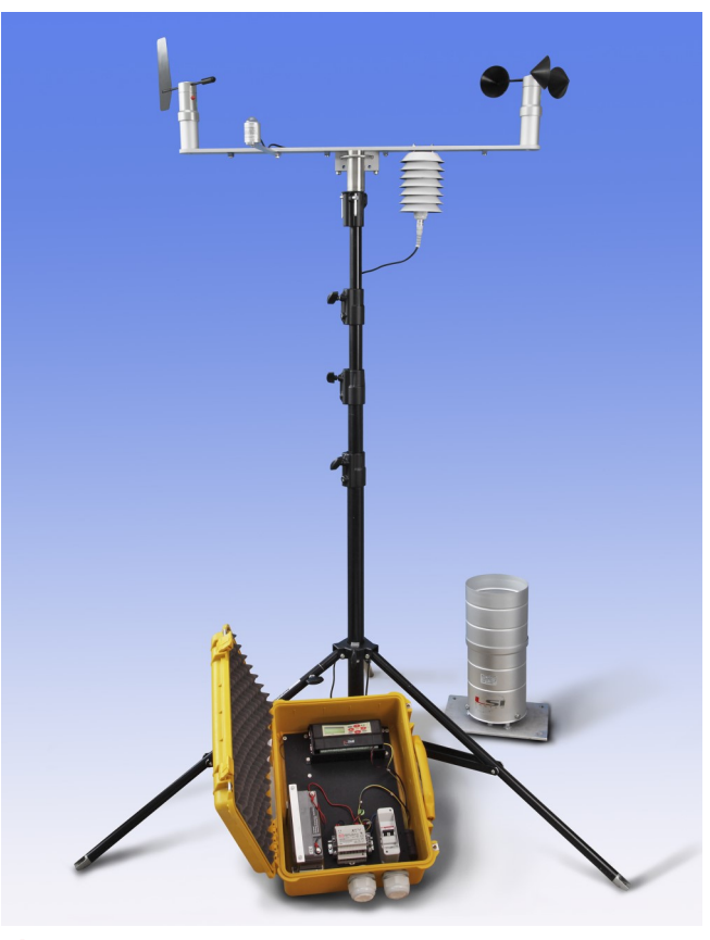
As a portable solution the KME package is equipped with a portable ELF432 enclosure and DYA340 tripod.