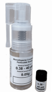
0.38 - 40µm Sample Range