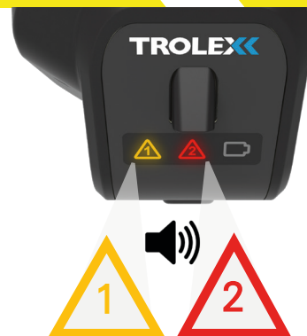
Audio/Visual Exposure Warnings