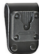
Belt Loop Dock