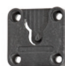
Screw On Dock