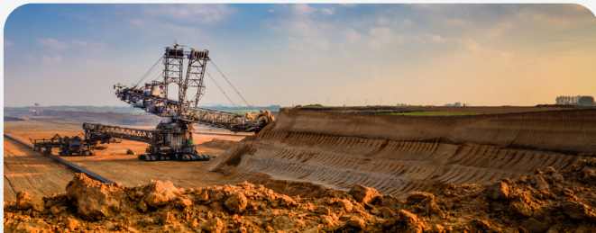
OPEN PIT MINING & LANDFILLS