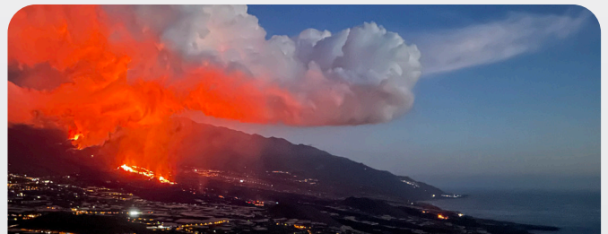
NATURAL RISK AREAS