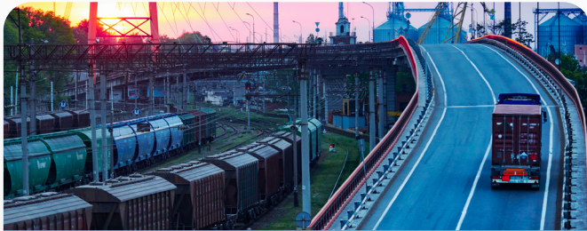
NETWORK WITH ROADS, RAILS & PORTS